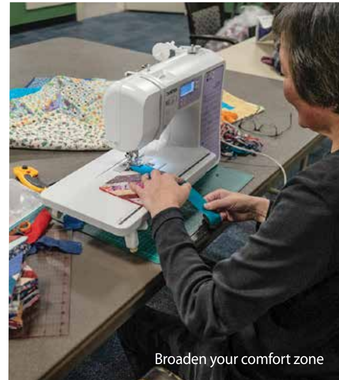
Broaden your comfort zone

On Facebook find us at: Community Centred College for the Retired , share our post and like us. 👍