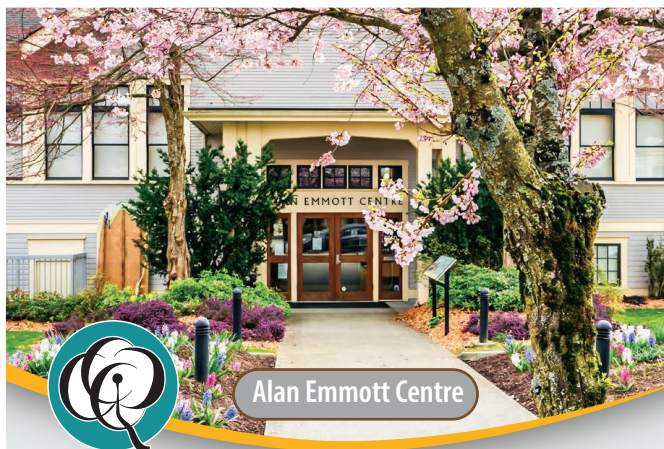
Alan Emmott Centre

Donations welcome. Tax receipt available.