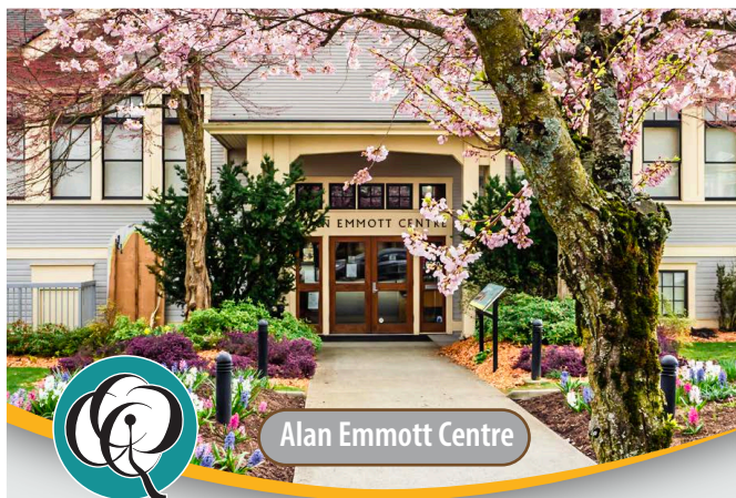
Alan Emmott Centre

Donations welcome. Tax receipt available.