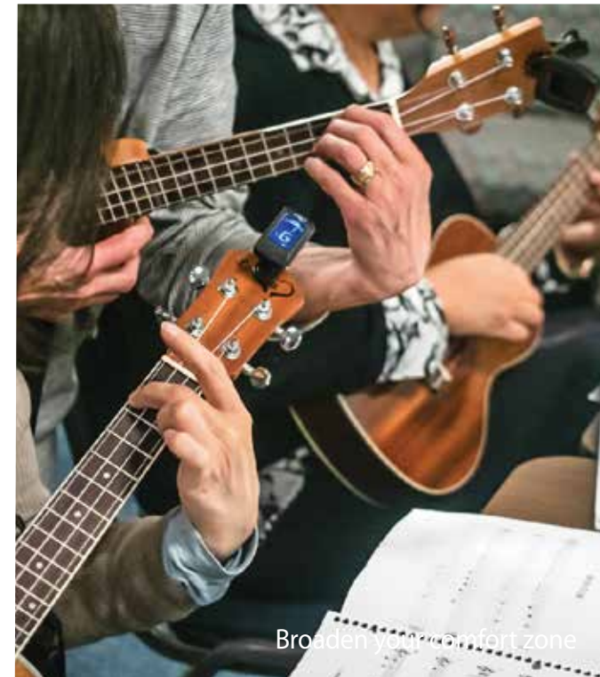
Broaden your comfort zone

On Facebook find us at: Community Centred College for the Retired , share our post and like us. 👍